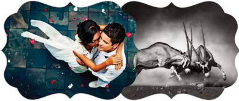
BENELUX, available in white and clear gloss

Each shape is available in three different sizes.