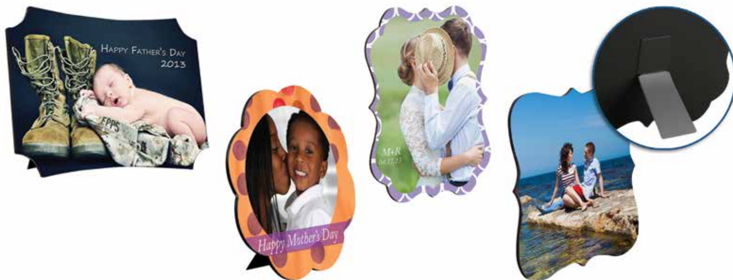
Table top panels are also available in 4 unique Creative Border designs. Finished with a black back and edge, images are infused into .125" Gloss White wood photo panels, which also come with a black aluminum easel for easy display.